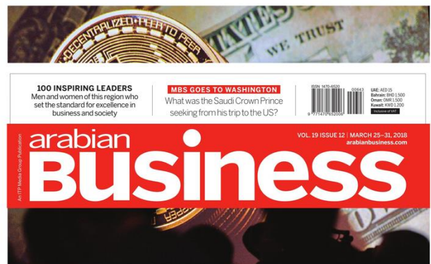
• Bitcoin was merely the first financial application to utilise blockchain technology

Blockchain is a technology, just like the Internet. Solution providers like Ateon build applications that utilise the power of blockchain, and we have the first card scheme on the blockchain rails from our technology partner, Softio. Not only does our solution provide end-to-end digital